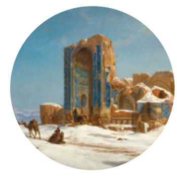
ROOM 31 JJules LAURENS, The Blue Mosque in Tabriz, Persia, 1872