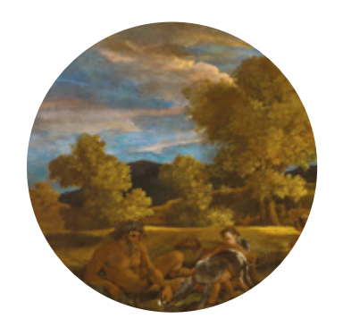
ROOM 11 Nicolas POUSSIN, Venus and Adonis. View of Grottaferrata, circa 1626