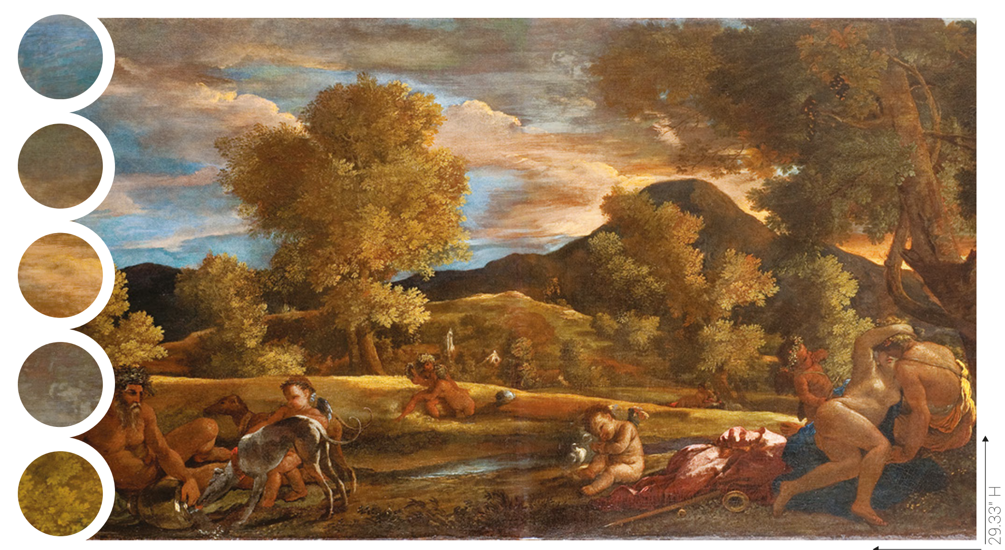
Nicolas POUSSIN, Venus and Adonis. View of Grottaferrata, circa 1626, oil on canvas (detail)