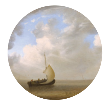
ROOMS 1 TO 8 Willem VAN DIEST, Calm Seascape, 1646

A location map is available at the museum's entrance.