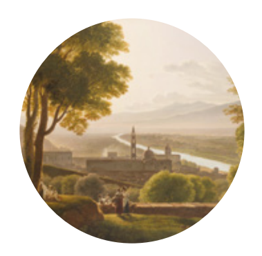
ROOM 22 Louis GAUFFIER, A View of the Arno Valley in Florence, 1795